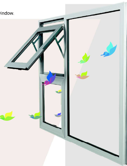
A 3D presentation of the Crealco Swift 30.5 cross-section